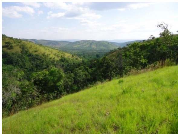
Figure 1. Buhamila area, Kagera region, United Republic of Tanzania, June 2013.

The Karagwe-Ankolean sequence covers the northwestern part of Tanzania on the border zone between the Western Internal Domain and the Eastern External Domain of this orogen. The rock outcroppings are predominantly metasediments characterized by the intrusion of mafic intrusive bodies at approximately 1.275 Ga (mainly basic sheets), A-type granitoids at 1.250 Ga and post-orogenic tin granites with an age of approximately 1.0 Ga.