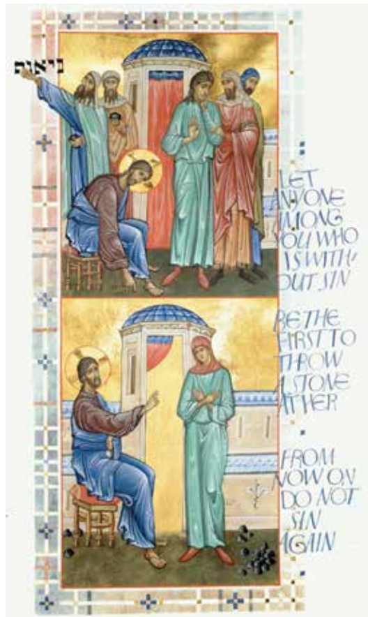
Woman Taken in Adultery

A year later, I had a second opportunity to use this illumination with an alumni group of men who had studied for the priesthood. While it is tempting to recycle an old reflection, I couldn't because visio divina provides an opportunity to see with new eyes, as it did for me and the men gathered. In my sacred gaze that time, I noticed my resistance to those men on their pedestals throwing stones at the woman, thinking, "how dare they?" I even felt a little smug when Jesus said, "Let anyone among you who is without sin be the first to throw a stone at her." I visualized them leaving the scene, one by one. In my lectio divina , the phrase that stood out for me was "such women" when the scribes and Pharisees said to Jesus: "Moses commanded us to stone such women. So what do you say?" These two words, "such women" made me feel the contempt and utter disregard the phrase conveys in this context because they isolate and objectify the woman. We have often heard or referenced "such women" in a negative light. For example, "such women" just want power, or "such women" want to be ordained deacons or priest. What did these words and this illumination mean for the clergy gathered? What did it mean for me?