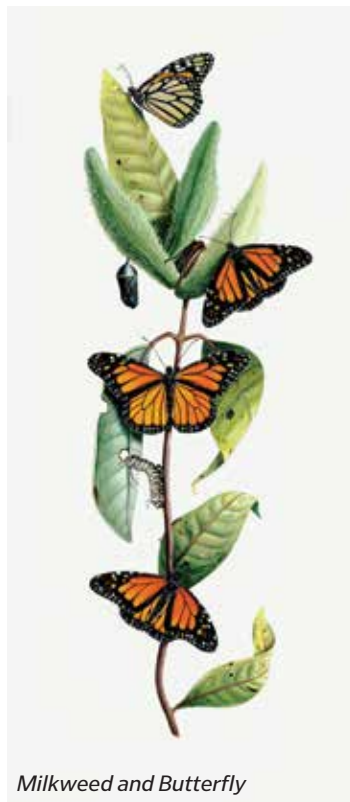
Milkweed and Butterfly