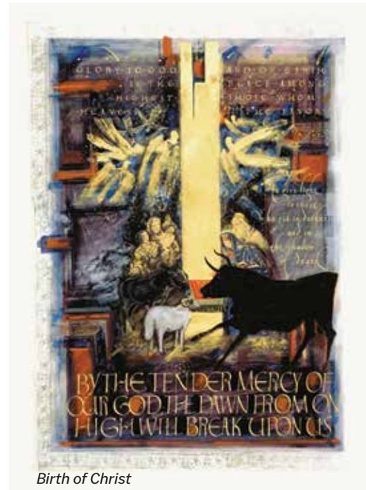
Birth of Christ

resent the seven days of creation, invokes a spiritual framework for busy people who are overly committed. The seventh day, the Sabbath, is a panel filled with shades of gold, which was chosen to represent the divine mystery of God. The visio divina process allows us to know ourselves better. How many of us can lay claim to a Sabbath that is void of anything other than an immersion in the life of God? The response to this question