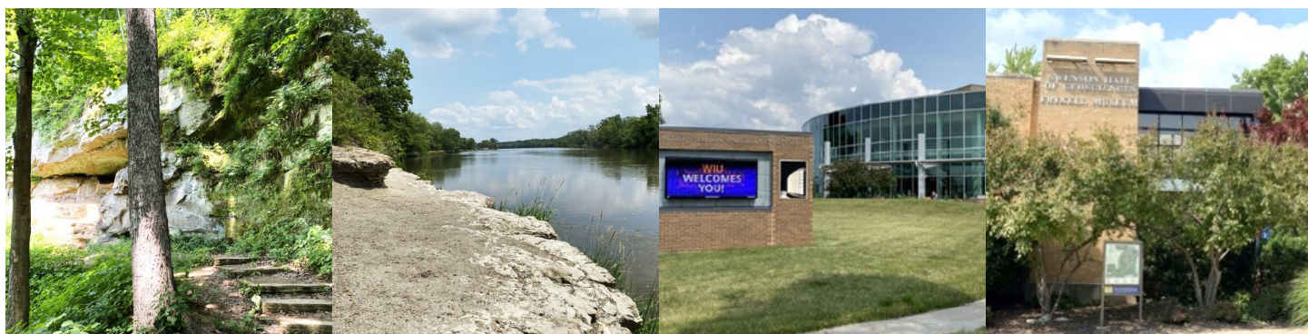
Left: Wildcat Den State Park; Left center: Black Hawk State Historic Site; Right center: Western Illinois University–Quad Cities Riverfont Campus; Right: Fryxell Geology Museum, Augustana College.

Recommended Citation: Sigma Gamma Epsilon, 2024, Sigma Gamma Epsilon – Call to convention First Notice: The Compass: Earth Science Journal of Sigma Gamma Epsilon, Vol. 93, Iss. 2, Art. 1, p. 95, doi: 10.62879/c66241114 .