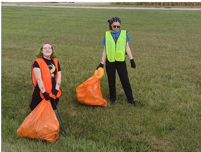
FIGURE 2: Two Gamma Chi members have collected hefty bags of trash.