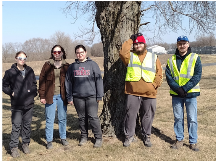
FIGURE 3: Members of the Gamma Chi Chapter pose during an Adopt-a-Highway event in Spring 2024.