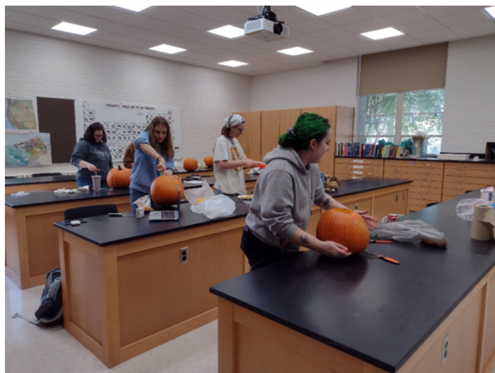
FIGURE 6: Students hard at work carving pumpkins for the Gamma Chi Pumpkin Carving Contest.