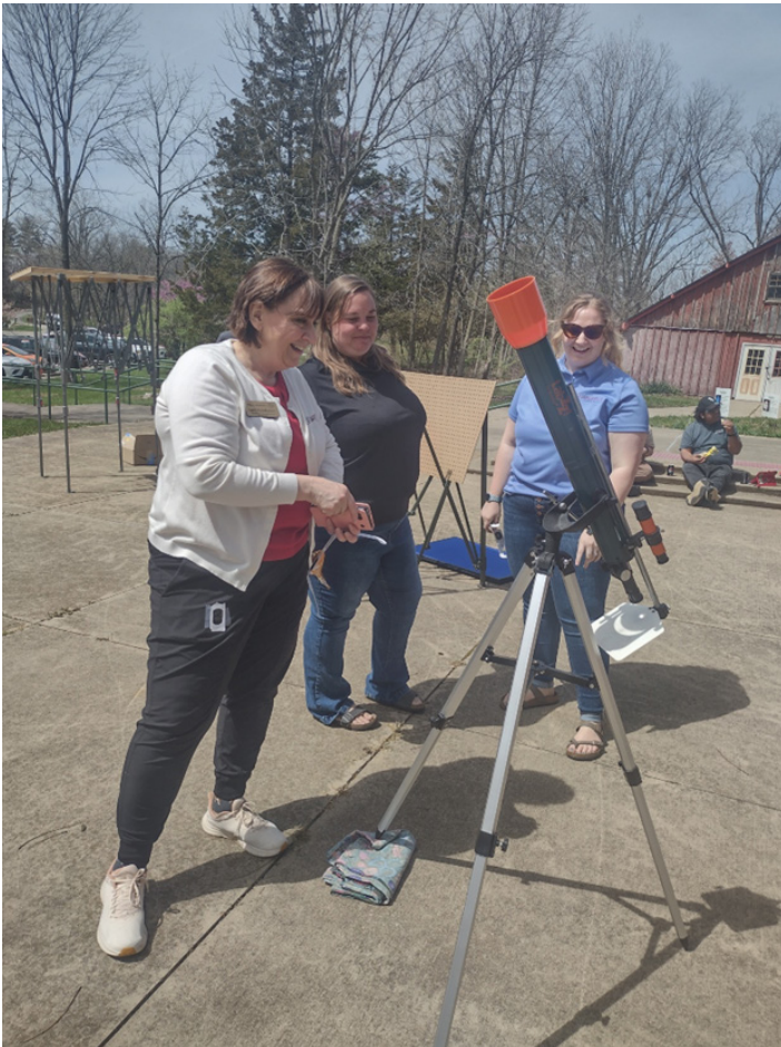
FIGURE 5: A telescope is employed to safely project an image of the solar eclipse.