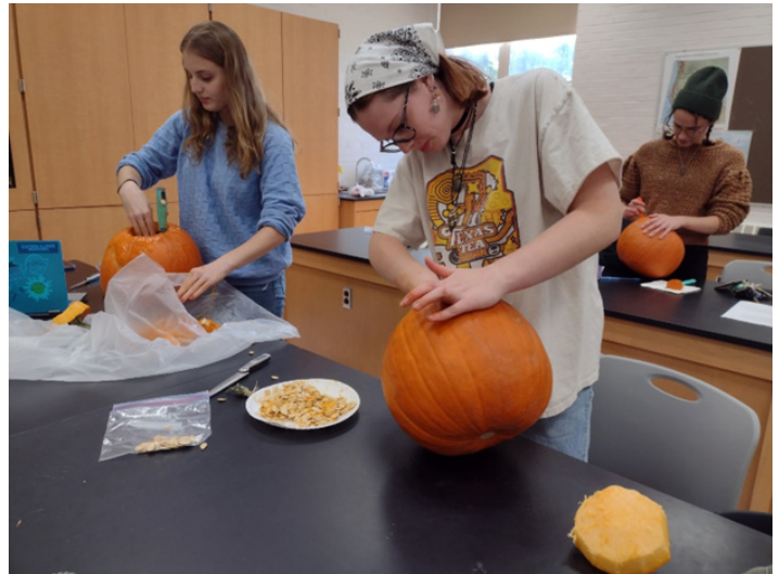
FIGURE 7: Students hard at work gutting pumpkins for the Gamma Chi Pumpkin Carving Contest (Photo: Gamma Chi Chapter).