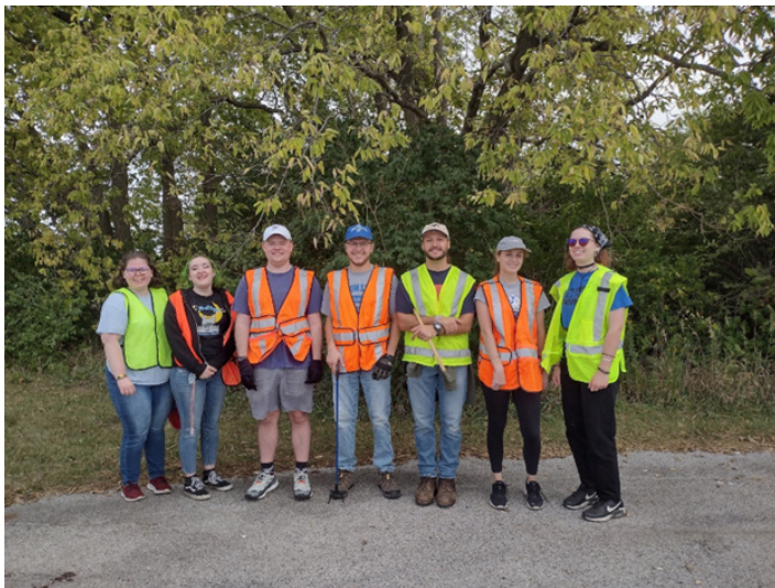
FIGURE 1: Fall 2023 Adopt-a-Highway crew.

Gamma Chi continued environmental improvement