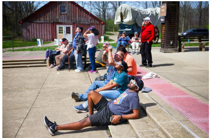
FIGURE 4: Students and the public view the solar eclipse at the Lincoln Log Cabin Historical Site, April 8, 2024.

by cleaning up their assigned Adopt-a-Highway section in both Fall and Spring (FIGURES 1 TO 3). Members provided education opportunities to the public about the total solar eclipse in April 2024 at a satellite viewing location the Lincoln Log Cabin Historical Site. Visitors were able to view the eclipse through special glasses, telescope projection, and "pegboard" (FIGURES 4 AND 5). Departmental interaction was fostered through a Halloween Pumpkin Carving contest, and a sample of entries is provided (FIGURES 6 TO 8). This is a subset of activities that supported engagement and education.