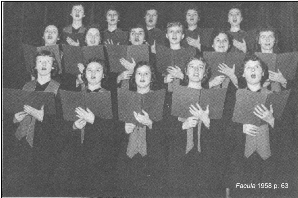
Facula 1958 p. 63