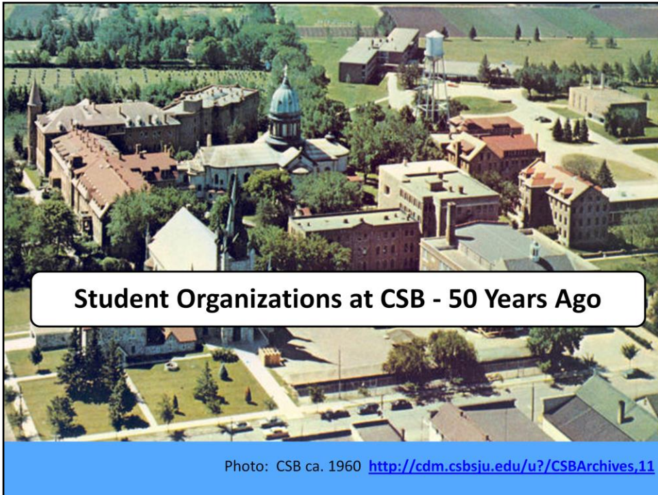
Student Organizations at CSB – 50 Years Ago