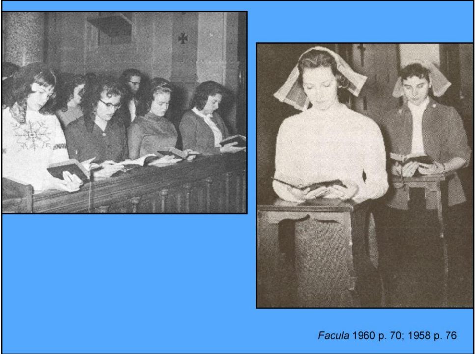
Facula 1960 p. 70; 1958 p. 76