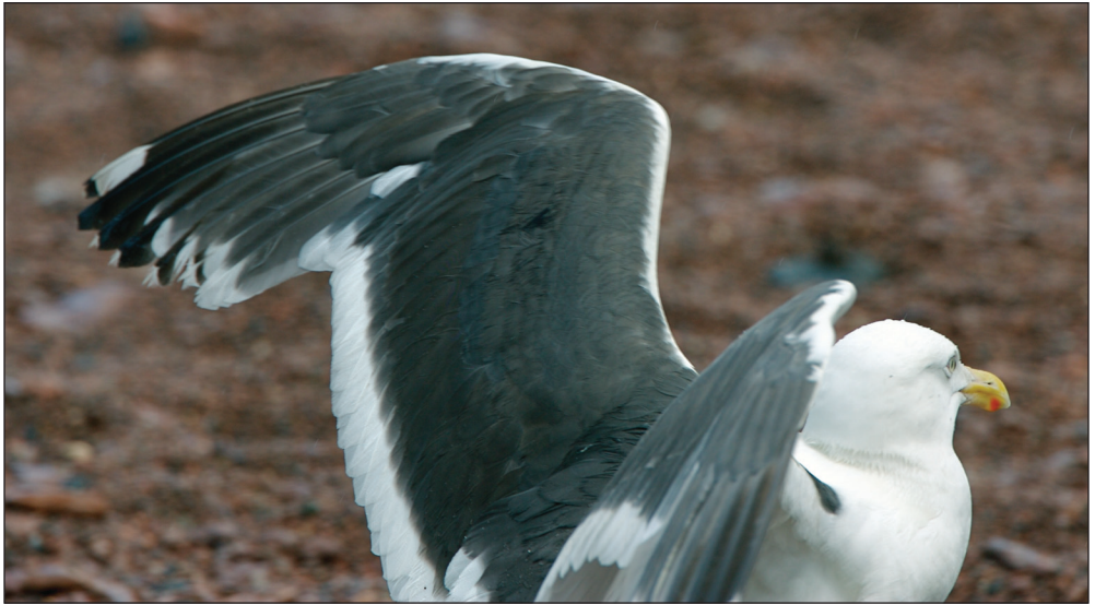
Figure 1. Slaty-backed Gull wingtip pattern, Grand Marais, Cook County, 22 July 2006.

best-known field mark for an adult Slaty-backed.)