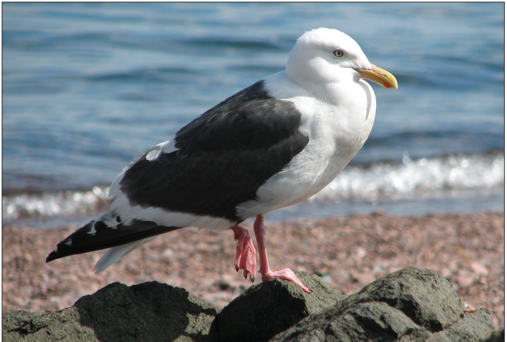
Slaty-backed Gull, 22 July 2006, Grand Marais, Cook County.

(4) For P8 through P5, the tongue (Dwight 1925) — the gray (in this case, dark slate gray) area occupying the proximal portion of each feather — was tipped with white, so that, for each, a white area separated the gray of the feather base from the black near the feather-tip (Figure 1). The white tongue-tip on P8 was narrow, whereas those on P7, P6, and P5 were broad. (The series of white tongue-tips was dubbed a "string of pearls" by Goetz et al. [1986], and is arguably the