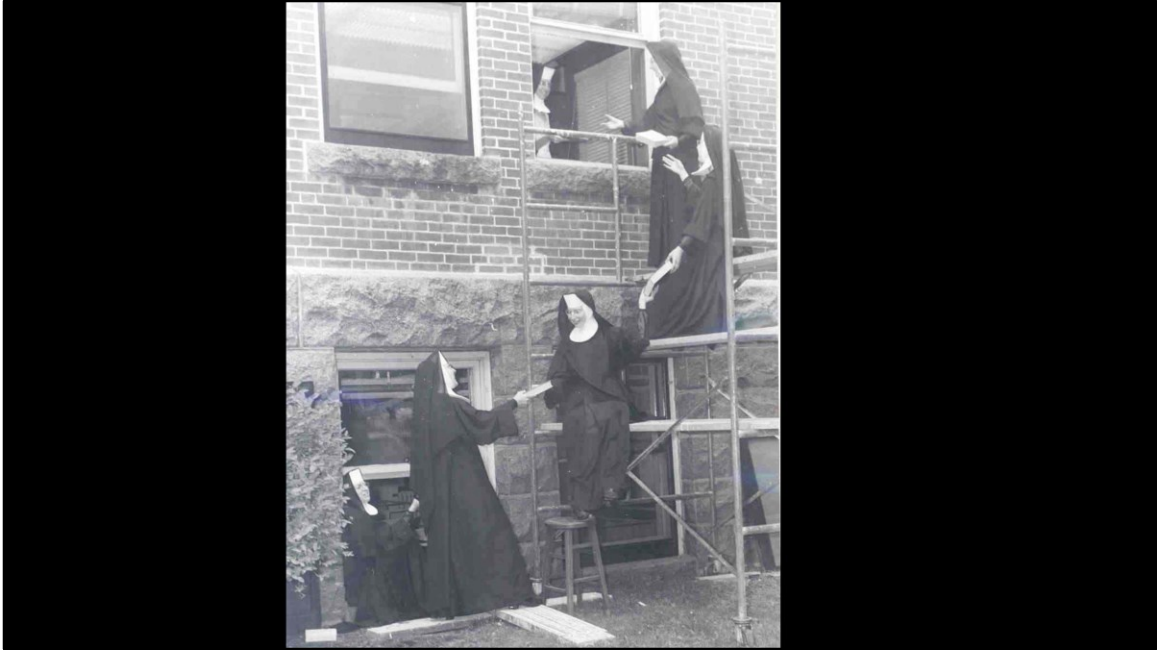
Moving the books from the first floor of Teresa Hall to the basement after the new gym was built