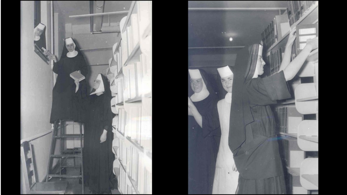
Moving the books from the first floor of Teresa Hall to the basement after the new gym was built Photos from the CSB Archives