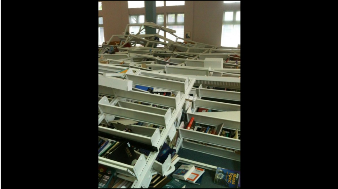
2013, Clemens Library, CSB