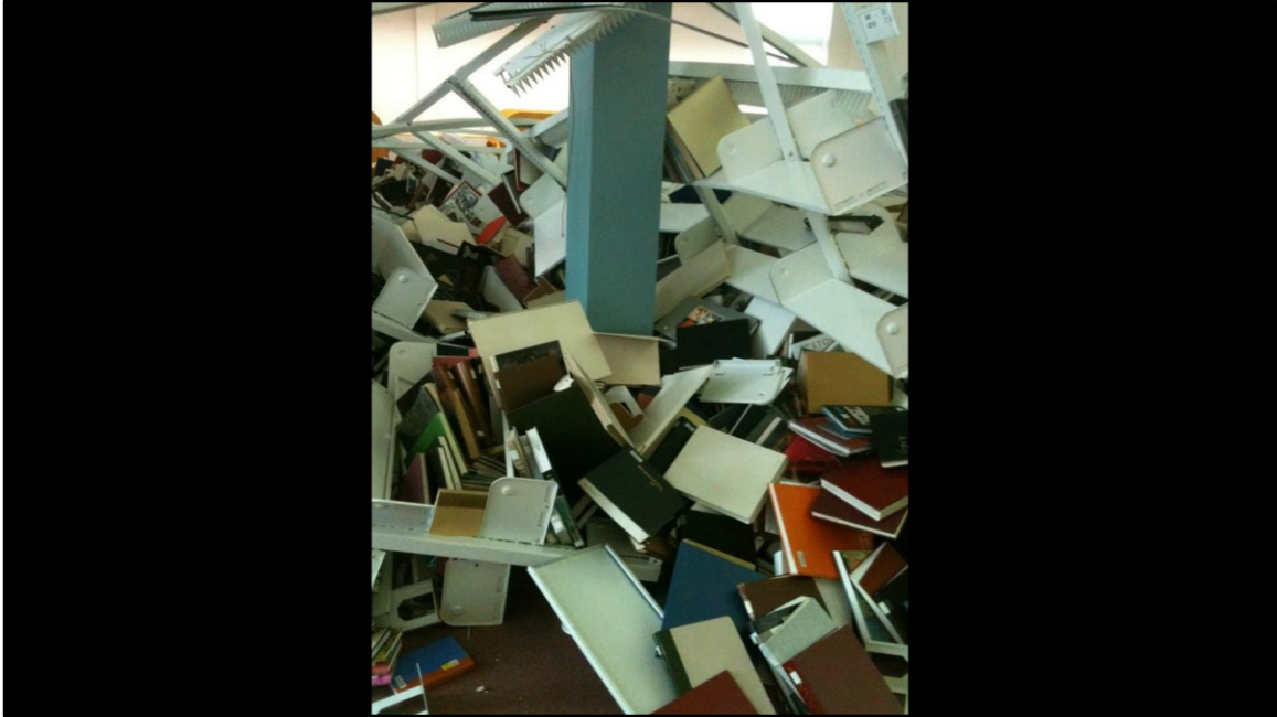
2013, Clemens Library, CSB