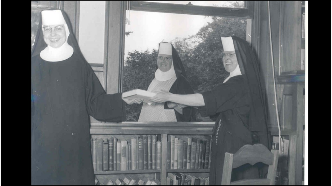
Moving the books from the first floor of Teresa Hall to the basement after the new gym was built