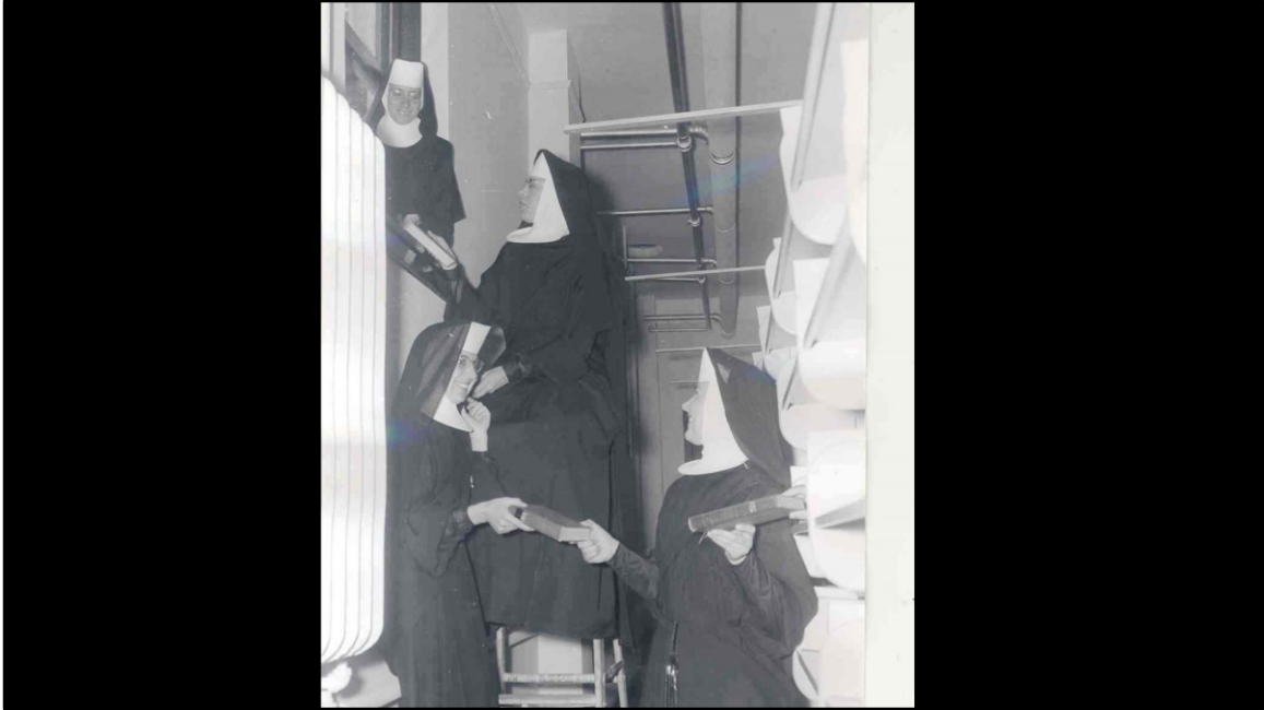
Moving the books from the first floor of Teresa Hall to the basement after the new gym was built