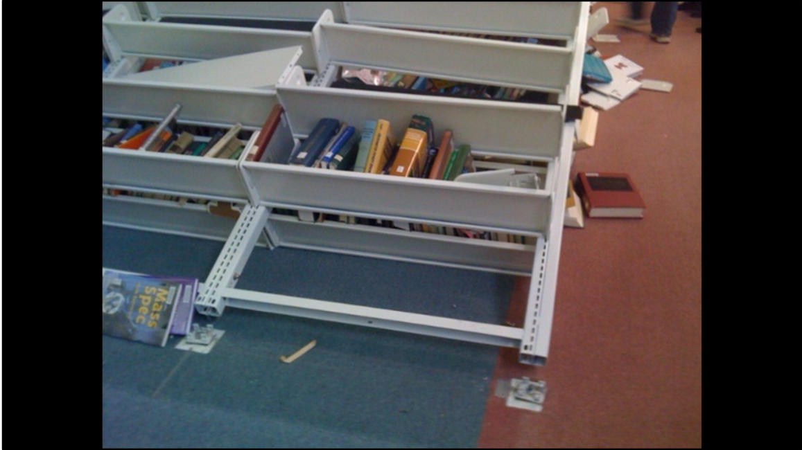
2013, Clemens Library, CSB