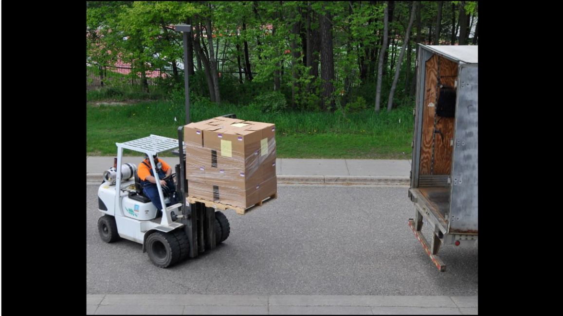
Load the pallets onto a semi truck and haul the truck to a storage warehouse (in east St. Cloud) where it is unloaded Bruce Walkley is operating the forklift