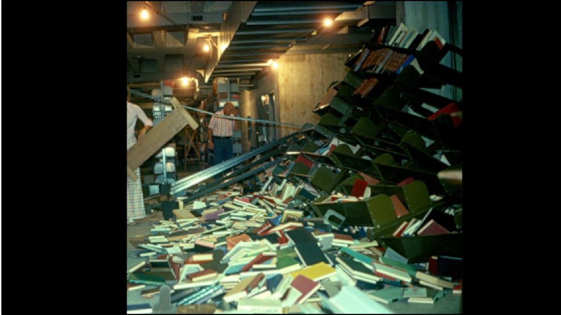
Alcuin Library, 1976 – As books were being shifted, all of the books on one side of double-faced shelving had been removed, causing instability; that row toppled over onto the next in a domino effect.