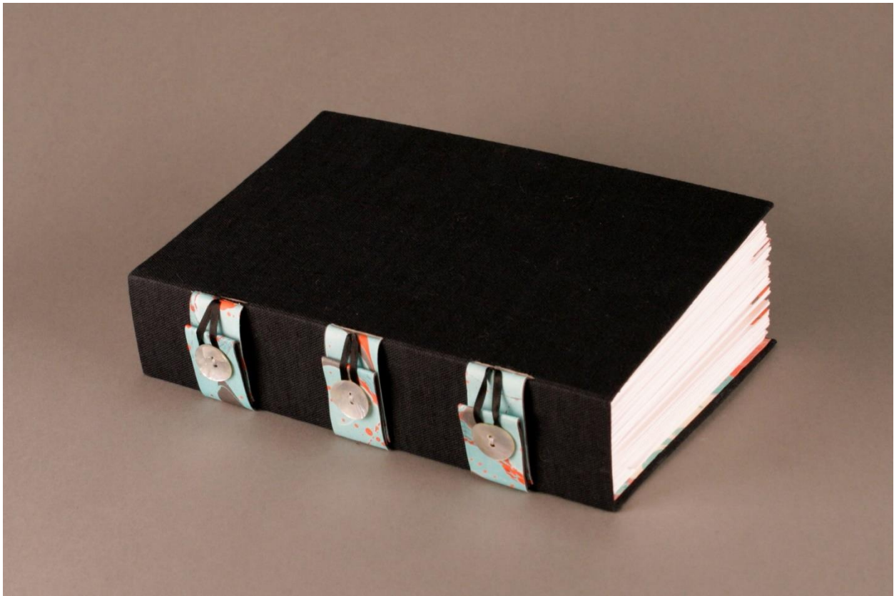
Figure 2. Tristram Shandy , closed.

When the book is closed, the handmade book resembles a typical closed codex. However, the book is literally buttoned together.