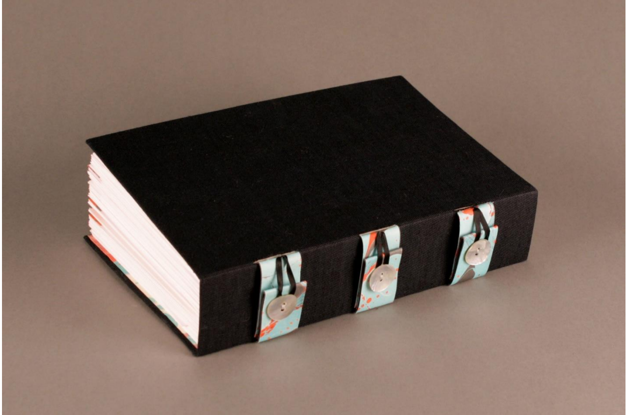
Figure 8. Tristram Shandy , back cover.

The closed book in the hand asserts the demands made by all printed books, and a few more besides. As attention shifts from the cognitive tasks of navigating a text, a reader may give conscious notice to the heft, the texture, and the visual structure of the physical object that is a printed book. Sooner or later, that reader must decide its place, its function, and its fate. Upon closing this book, the reader may consider its visual and material characteristics. Certainly the reader must collect its trailing elements – the long, button-studded bookmark, and any passages no longer buttoned or slotted into the book – and must decide where to deposit the book. As for its function and fate, much depends on the degree of sensory and intellectual pleasure it has offered. ‘[I]n the end’, perhaps it will ‘prove the very thing which Montaigne dreaded his essays should turn out, that is, a book for a parlour-window’ (I: 5).