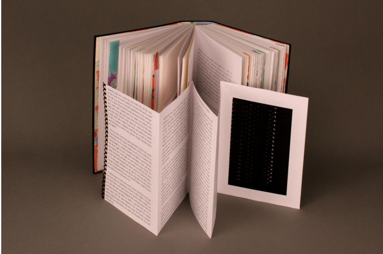
Figure 6. Tristram Shandy , black page. © Rachel Melis.

The accordion-fold insert differs structurally and in crucial ways from the folded and gathered pages of a codex. The structure of alternating mountain and valley folds allows a reader multiple ways of interacting with the printed pages. The reader's hands determine whether the accordion is folded in a way that resembles a codex, with a valley fold at the centre and other planes concealed behind the left-most and right-most mountain folds. Only the black-lace leaf at the end of the accordion-fold sequence must be turned to reveal its verso . Alternatively, the reader can extend the accordion-fold insert and see all of the printed rectangles at once, reading them as side-by-side panels. Again, only the verso of the black-lace leaf would require a page turn. Of course, the accordion-fold insert affords numerous combinations of folds and extensions. A reader enacts choices that involve the mind, the hand, and the eye, not only while interacting with the accordion-