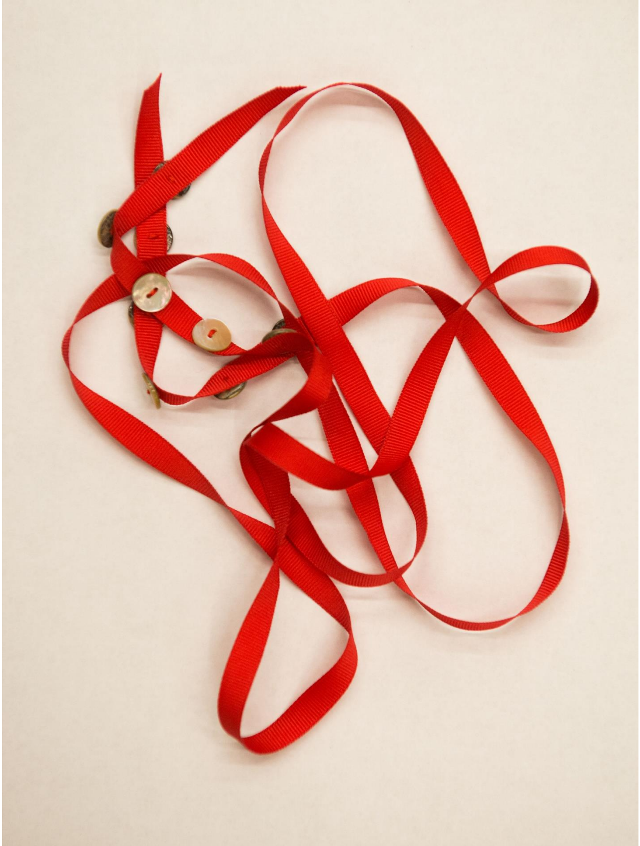
Figure 3. Tristram Shandy , bookmark. © Adam Konczewski.