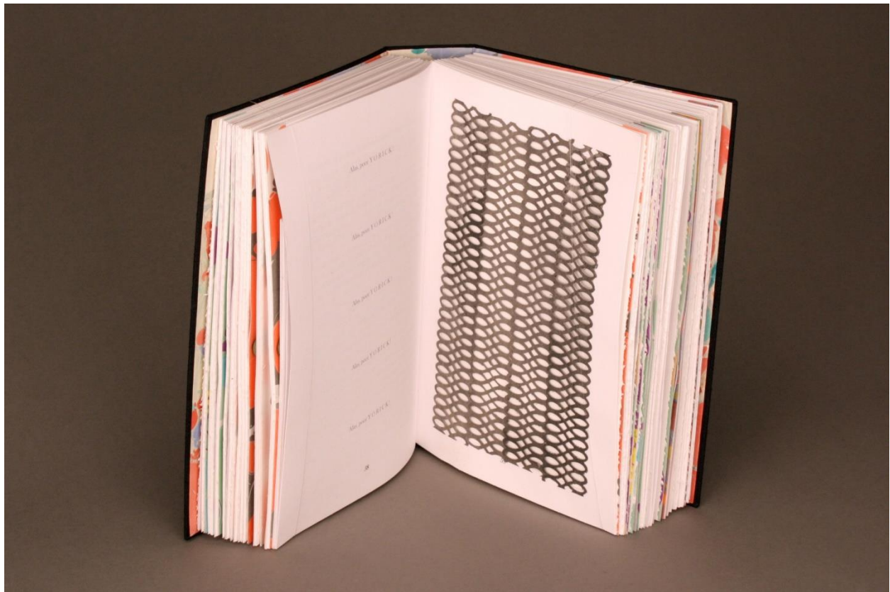
Figure 7. Tristram Shandy , grey page. © Rachel Melis.

fold insert but also after reaching its end (that is, the black-lace leaves): the structure allows the Yorick story to be left standing or folded flat, set aside or reinserted into slits in the book. No matter which choices the reader makes about the accordion-fold digression that is Yorick's story, the chapter in the codex continues through the grey-printed text of Yorick's story and a grey-lace leaf.