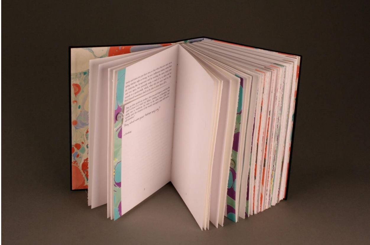
Figure 1. Tristram Shandy , open. © Rachel Melis.

In its structure and materials, this edition highlights the odd formal features of Sterne's novel and the difficulty of assembling an 'integrated, coherent mental representation' of the text. The removable, lengthy interpolated documents – the marriage settlement, for example, which is printed on buff-coloured parchment paper and decorated with a round red seal – differ in form and material from the bound pages of the codex that preceded them. If the reader is familiar with eighteenth-century legal documents, the sensory experience of viewing and handling the parchment and manipulating the seal to open this interpolated text is likely to shift attention away from the passage that preceded it, and reading it is likely to activate the recall of the laws governing eighteenth-century marriage practices as well as the material form and discourse of legal documents. As van den Broek and White observe, 'the capacity of working memory or attentional