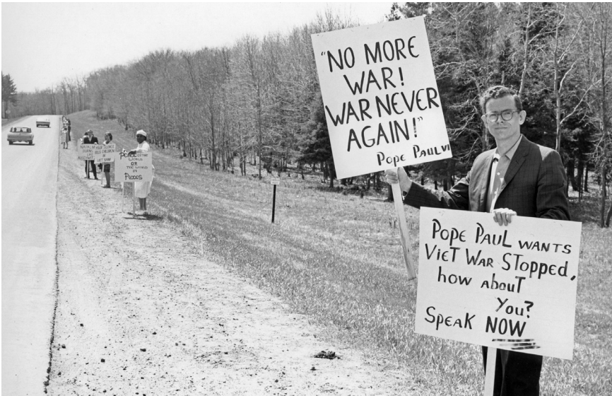
Vietnam War protestors line the road during Vice President Hubert H. Humphrey's visit to Saint John's University for the Alcuin Library dedication, May 7, 1966.

One of the most striking similarities between the Vietnam and Iraq wars lies in the trajectory of domestic support. In August 1965, soon after the first regular U.S. combat units went to Vietnam, 61% approved, while only a quarter thought we were making a mistake. Similarly, as much as 75% of the public approved of the Iraq invasion in March 2003. In both cases, the public gradually tired of the war. With Iraq, the lack of progress and the strain on the military from multiple deployments appears to have been the key factors in convincing 60% or more by early 2007 that we had made a mistake. In Vietnam, it took almost three years, close to 20,000 combat deaths, and the apparent lack of progress revealed in the February 1968 Tet offensive before a plurality regretted our engagement.