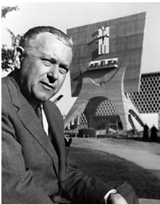
Marcel Breuer, architect

I grew up in a medium-sized Midwestern city that was not particularly striking or noteworthy, the kind of place most Americans grow up. A great place to live and raise a family, but not the kind of place you would visit as a vacation destination unless you had family or friends there. My exposure to the physical world tended to focus on nature. I spent some time on grandparents' farms, I enjoyed the outdoors through Boy Scouts, and family vacations tended to focus on nature: cabins, lakes, road trips in the Midwest. Travel in general in that era before cheap airfares tended to be limited to places one could drive.